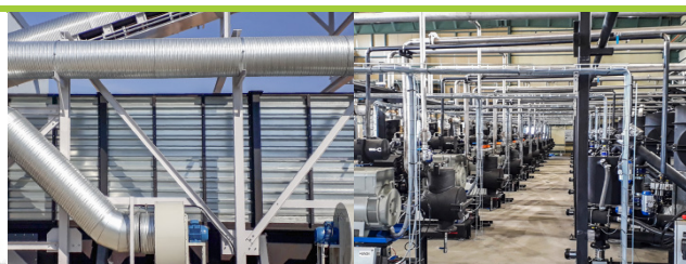
MOVING FLOOR BUNKERS